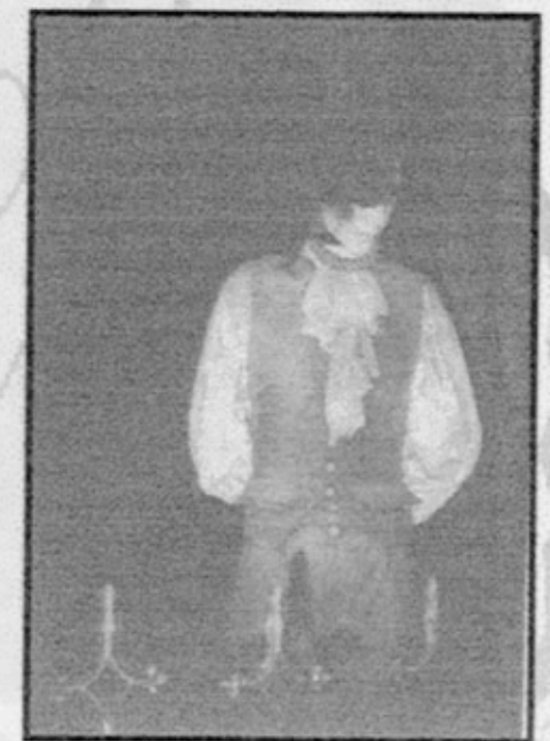
JUST HANGIN' OUT AT JEKYLL AND HYDE'S