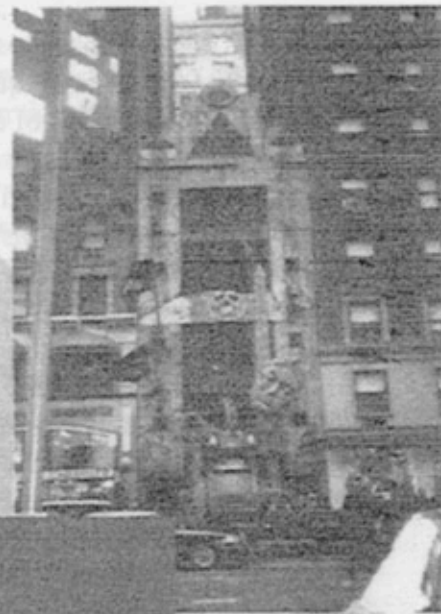
JEKYLL AND HYDE'S