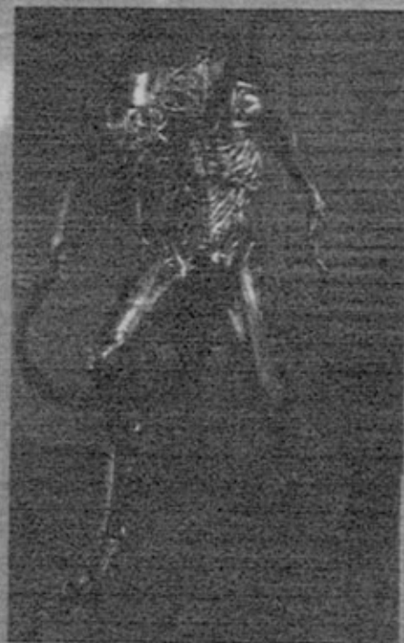
warrior alien prop

NEW THIS YEAR FROM MORRIS COSTUMES ARE MANY NEW MASKS AND PROPS THE ALIEN RESURECTION PIECES ARE MADE FROM ORIGNAL MOVIE MOLDS AND WILL BE AVAILABLE AT BETTER COSTUME SHOPS ACROSS THE COUNTRY JUST ASK!