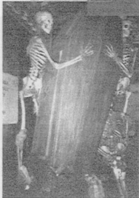
JEKYLL AND HYDE'S