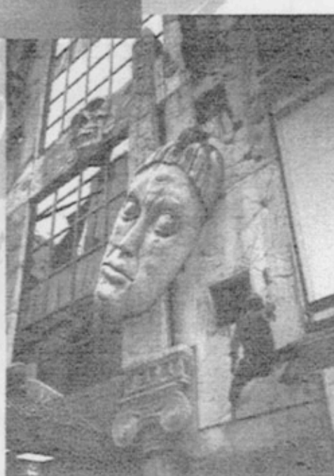
JEKYLL AND HYDE'S