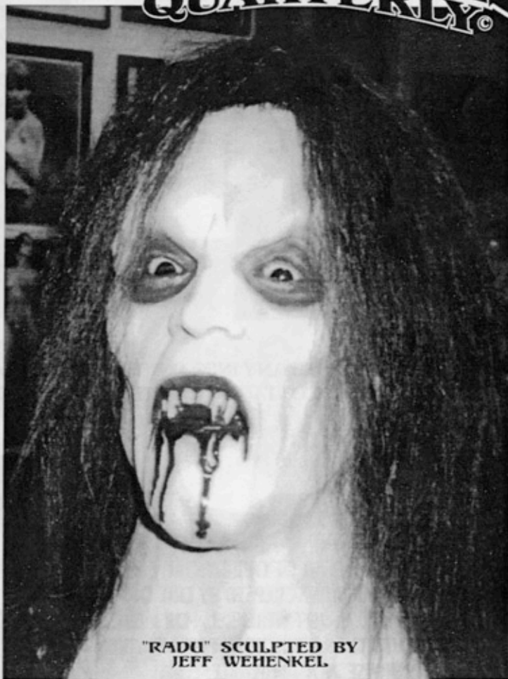
"RADU" SCULPTED BY JEFF WEHENKEL

THE NEWSLETTER OF COLLECTIBLE MASKS & PROPS