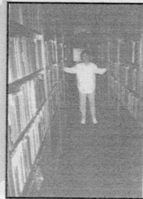
HEY!! WHERE'S THE RESTROOM

Unfortunately we were a little too late for the Jack The Ripper Pub. Apparently it had closed down because it was too much like the other restaurants. If you can't get to all of these locations I suggest hitting the larger J&H pub because there is so much to see, and it's well worth waiting in line for. Take extra cash for the gift shops and have plenty of film in your camera. Restaurants catering to monster fans are very few, and although McDonalds can get a little scary, nothing comes close to the creepy eats encountered at the Eerie pubs of New York City