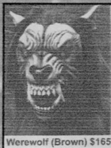
Werewolf (Brown) $165

c 1995 Pete Infelise (collar not included)