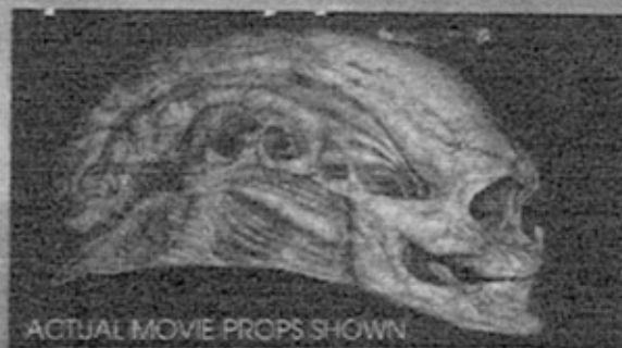
ACTUAL MOVIE PROPS SHOWN